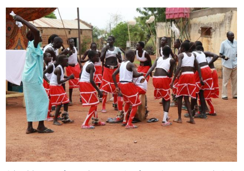
Cultural dancers perform at the Inauguration of a new State Revenue Authority in Aweil.