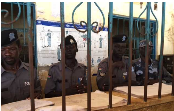
JIP personnel deployed to Gudele police station, 18 August 2017.

Chapter II, Article 5 of the Agreement on the Resolution of the Conflict in South Sudan provides for the establishment of the Joint Integrated Police (JIP), to be deployed in Juba, Bor, Malakal, Bentiu and any other locations, with a focus on areas where Protection of Civilians (POC) sites are located. The Joint Integrated Police play a critical role in ensuring communities feel safe and confident to leave the PoC sites