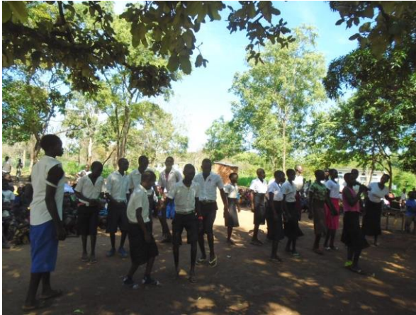
Pupils of Mapiso Primary School performing in front of the audience during the ceremony