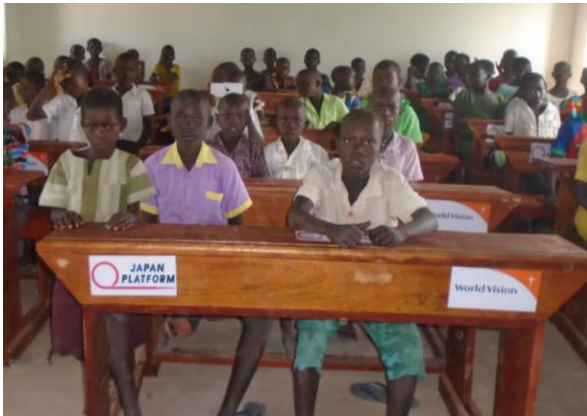
Pupils inside the newly constructed classroom at Mapiso Primary School